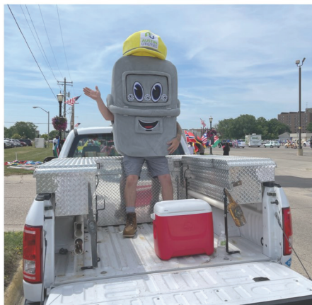
Introducing AU's mascot, Meter Buddy

Austin Utilities participated in this year's Fourth of July parade in Austin and featured our alternate fuel vehicles. Our 2016 Ford F150 pickup was retrofitted with a compressed natural gas kit, and our Nissan Leaf electric vehicle (EV) was purchased in 2020. Customers who own EVs can join our EV Owners Club and earn $30 in Chamber Bucks.